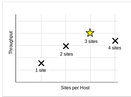
Figure 5.2. Determining Optimal Sites Per Host

By graphing the relationship between throughput and partitions using a benchmark application, it is possible to maximize database performance for the specific hardware configuration you will be using.